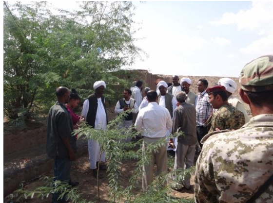
Photos (35 to 36) Traditional field spill way in Wadi Zabid irrigated fields