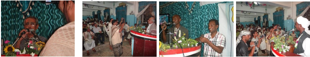
Photos (44 to 47) speech of chairman of irrigation council and TDA – south branch manager and participants

At 27/11/2013 night the irrigation council in wadi zabid with help of spate project in Yemen made a closing ceremony for the workshop in the collage of education in Zabid. In this ceremony several speeches for TDA- South branch manager and chairman of Irrigation council which were discussed the spate history in wadi Zabid and the formation of WUA's and Irrigation Council and their functioning, in addition to some speech for international participants. Then through the ceremony some traditional dancing and other activities were done. At the end of this ceremony the certificates for all participants in distributed.