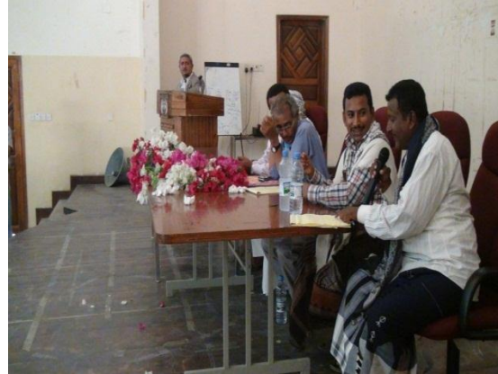
Photos (9 &10) Yemen wadis WUA's and Farmers presenting the experiences and knowledge