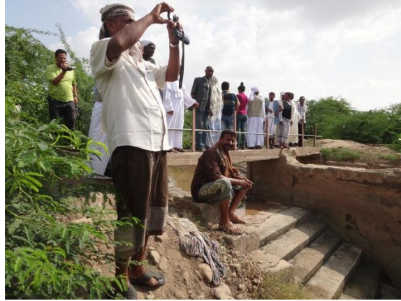
Photos (39 to 41) Improved traditional division structure between Garhazi and Ebry main canals