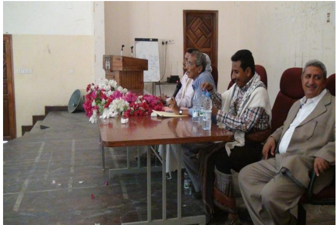
Photos (3 to 8) Presenting the spate irrigation experience in different countries and Yemen different region

Third the exchange experiences and knowledge were presented from different countries participants and different Yemen wadis WUA's and Farmers participated in the workshop.