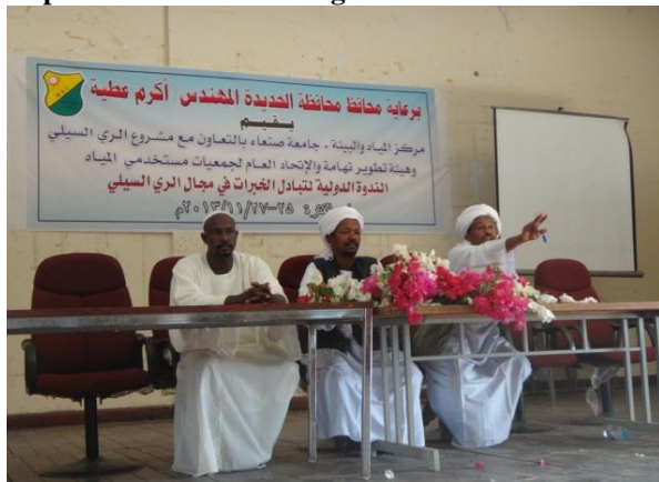
Photos (13 &14) Sudanese participants presenting the experiences and knowledge