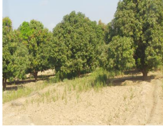
Photos (27 to 30) Wadi Mawr south canal some planting crops ( Banana, Mango and Sorghum )