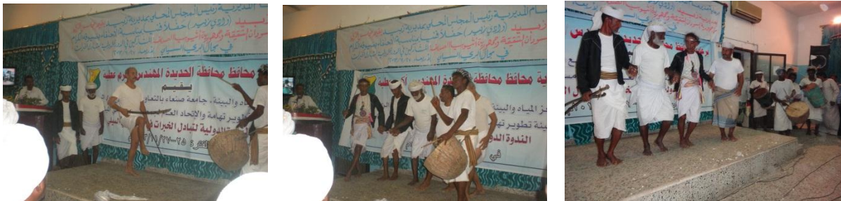
Photos (48 to 51) traditional dancing in tihama region in the closing ceremony