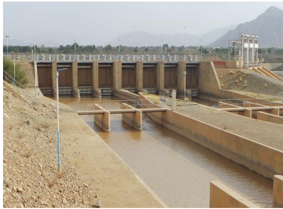
Photos (17 to 20) Wadi Mawr diversion structure, sluice gate, intakes