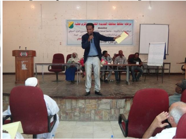
Photos (11 &12) Ethiopian participants presenting the experiences and knowledge