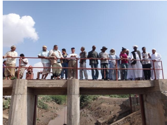
Photos (35 to 36) Improved control and off-take structure in Wadi Zabid main canal