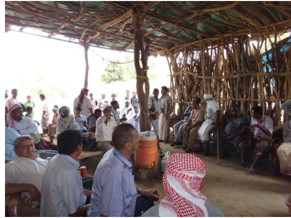
Photos (31 to 32) Wadi Mawr south canal small discussion with Framers and WUA's members